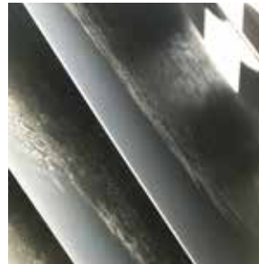
Grit retained on the lamellae.