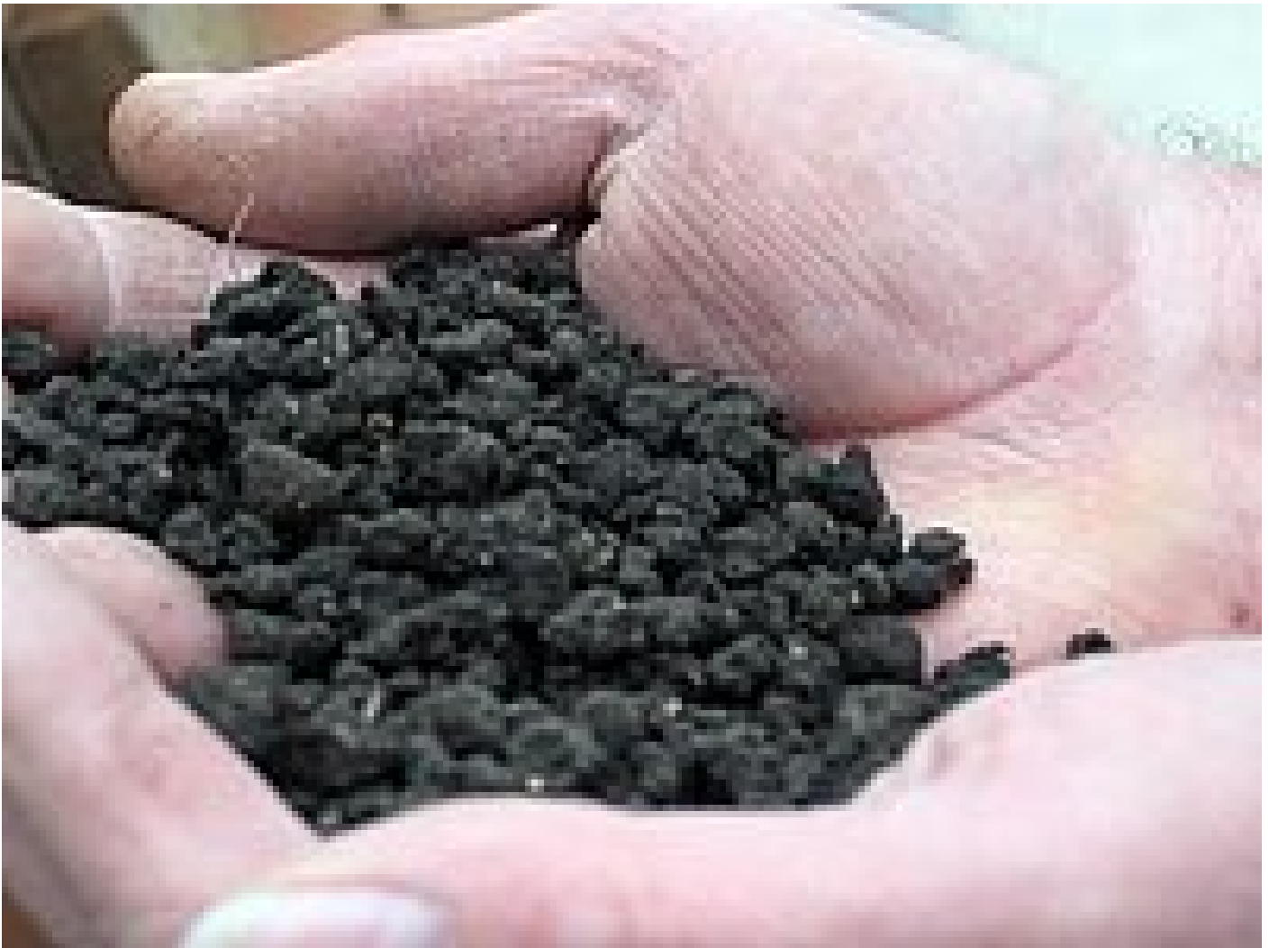
Free-flowing dried granulate with low dust content

The HUBER Solution for sewage sludge drying with solar energy is working with a continuous drying process, that is odourless due to complete restacking of the sludge. Its unique combination of sludge turning and transport performs both spreading and turning of the sludge as well as baxmixing and its transport from one side to the other. Due to their high efficiency our solar dryers can be operated the whole year round even in temperate climate zones with solar power alone. This gives of course an outstanding eco-balance and cost-efficiency.